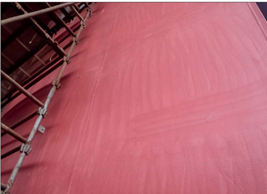
No repaint is needed on the rudder during this or future drydockings.