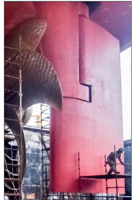
Rudder of m/v Deva after five years of service with Ecoshield.