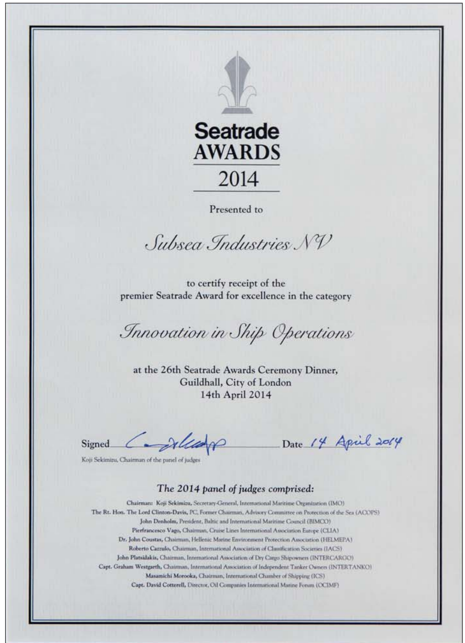
Seatrade 2014 Innovation in Ship Operations Award Certificate.

THE DIAMOND STANDARD IN STEEL PROTECTION