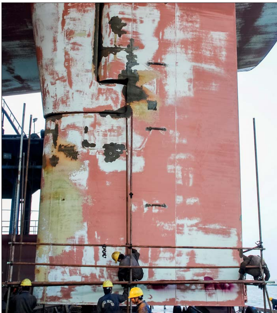
The rudder of m/v Deva when the vessel came into drydock five years ago, showing multiple damages.