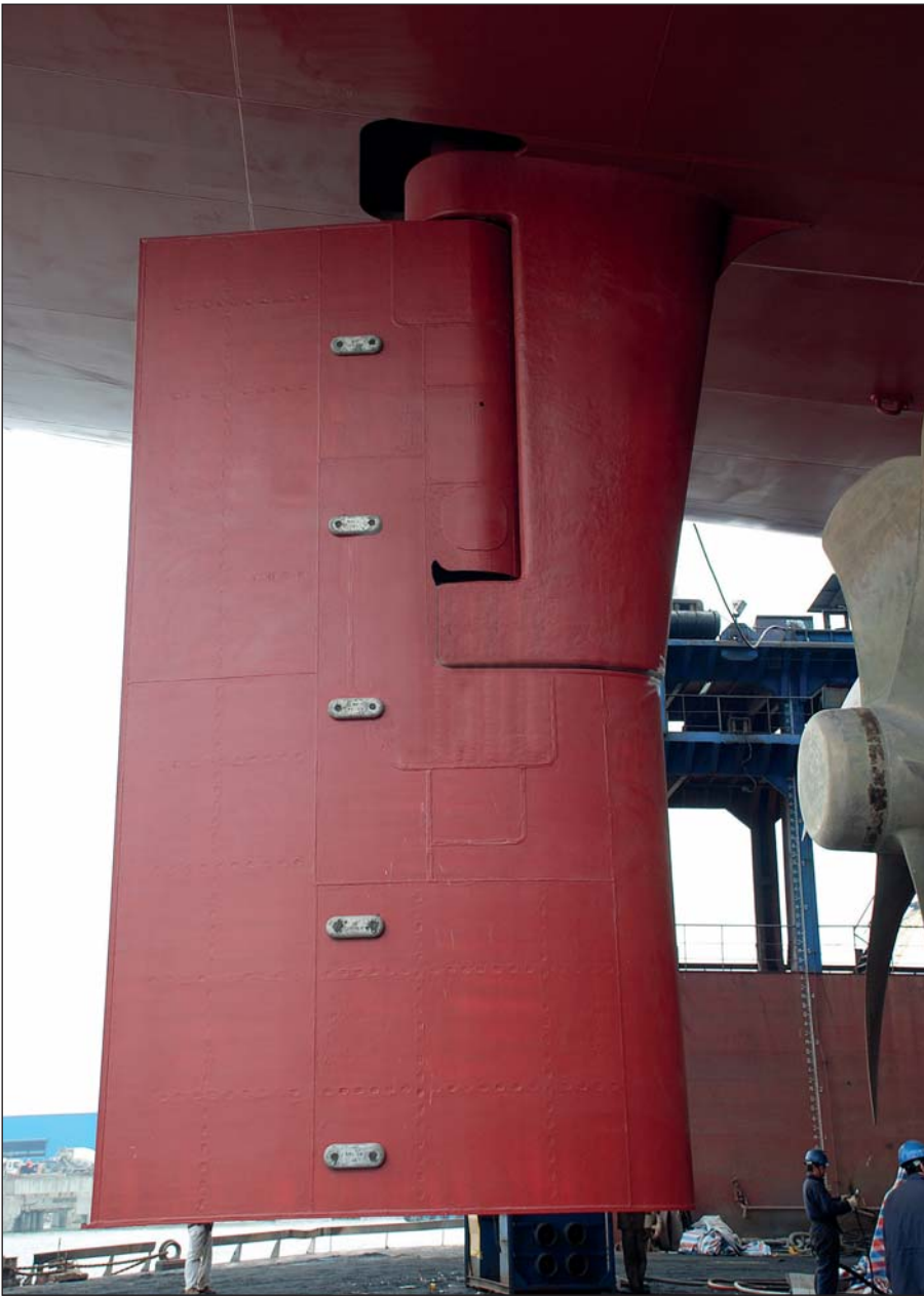
Ecoshield was applied in 2009, protecting the rudder from then on.