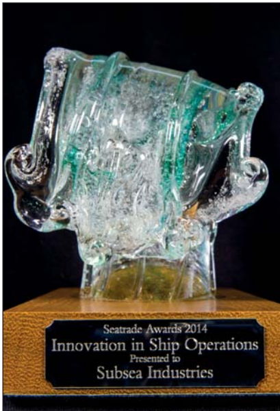
Seatrade 2014 Innovation in Ship Operations Award.